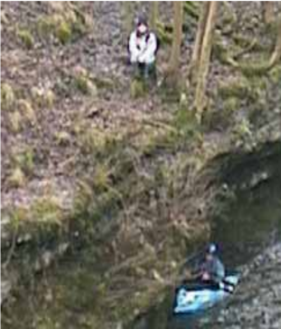
Who's that trip-trapping over my bridge?