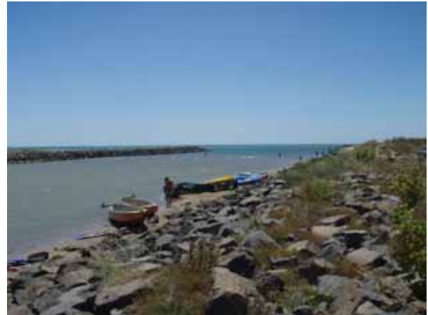
Where I worked from most days

I went out to France just after leaving college and finishing my A Levels to work for PGL, a children's activity holiday, a naïve 18 year old with no clue about what I had got myself into. I was a little disappointed when I received my contract for France, as I never did get placed in the Alps, where the premier paddling was, but instead I was stationed on the Mediterranean Coast working from sit-on-top kayaks just outside Béziers in a town called Vias-Plage.