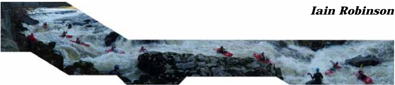
Me running Linton Falls on the Wharfe