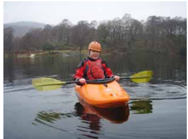
Waiting for the rest of the group to catch up before setting off down the river

The drivers headed off to Spark Bridge to leave two cars before returning to us on the lake to head south for the mouth of the river.