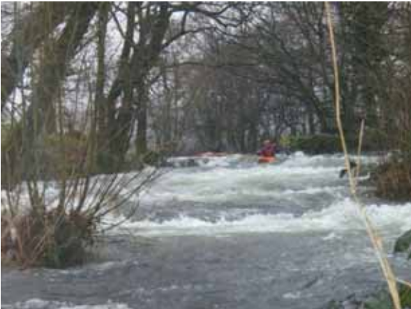
My dad descending the first main rapid on the Crake

the group had paddled together on many occasions so we knew each other's style really well. Eddies were caught and we maintained line of sight for most of the trip. When we came to the first difficult rapid we followed the usual measures. Send a couple of the better paddlers off downstream. One eddied out half way down and got out with a line, I headed to the bottom so I could see all the way back upstream and watch each member of the group descend the rapid and be ready for anything that occurred. It all went well and we moved on.