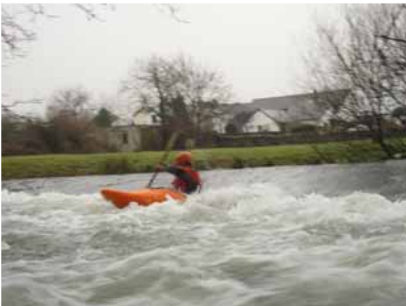
Successfully paddling the weir somewhere on the Crake

We carried on downstream doing what we loved doing - being out on the water, in good company, having fun escaping from everyday life for that short period. It was all going well and nothing unexpected had occurred.