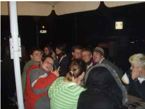
Out in Dunkeld on a night with the staff

It was all-good again and slowly I came to the end of my short six-week contract and again I was sad to leave Dalguise and its staff behind and go back south to Preston. All the same reasons as before applied and many more as well I suppose.