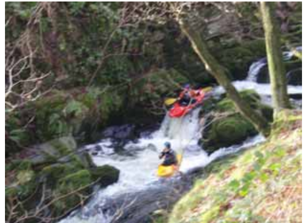
Descending Low Gill in the Lune Valley