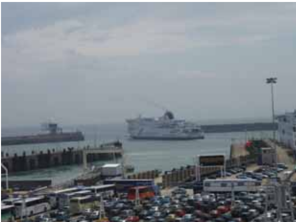
Setting sail for France; obviously not my ferry

A sentence to sum France up would have to be: "The best summer of my life," and that it certainly was.