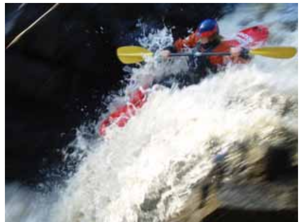
Me dropping in on Going Under, Leck Beck

These paddling missions have been amazing and I think in a thirteen-day period, we paddled eight days and managed to get down thirteen rivers. I don't think there is enough room to list these rivers but some of the highlights certainly have been the successful descents of the delightful Low Gill, Leck Beck and Linton Falls on the Wharfe. It has rekindled my passion for paddling, which whilst been away has taken a back seat as there weren't that many opportunities to get out and do the do.