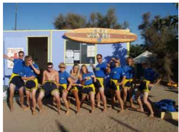
Some of the Water Sports Instructors

To be honest the first three weeks were not the most enjoyable and at times I really did wonder what I was doing out there. The work was monotonous and not like anything I had done before. Basically we provided fun sessions for teenage kids on a small section of salt-water canal just down the beach from our main operations and not once did I have to teach them sculling draws, T-draws or low-brace turns.