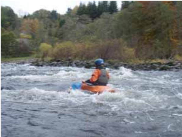
My line manager playing on the Tay

the lovely Tay Valley delivering a multitude of sessions to Scottish primary school kids.