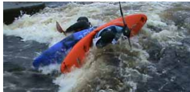
The Teesside Formation Paddling Team