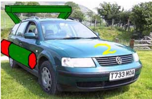
Thunderbird two parked at Rydal Water