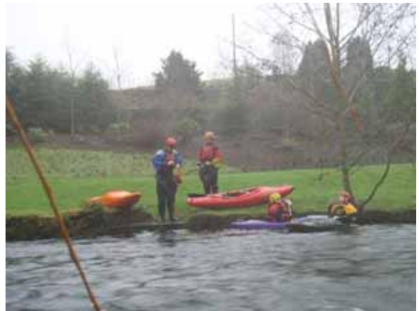
Packing away after a successful rescue just above Bobbin Mill Rapids

swimmer on the front of his boat and made his way to a suitable eddy to get the paddler to the bank. Meanwhile the paddle was recovered and I dealt with the boat with another member of the group. I emptied the boat upstream of the rest of the group and then made my way down with the boat on a sling held between my teeth so if anything went wrong I could easily get away from the empty boat. Things were sorted and we moved on down river doing what we loved doing - being out on the water, in good company, having fun escaping from everyday life for that short period.