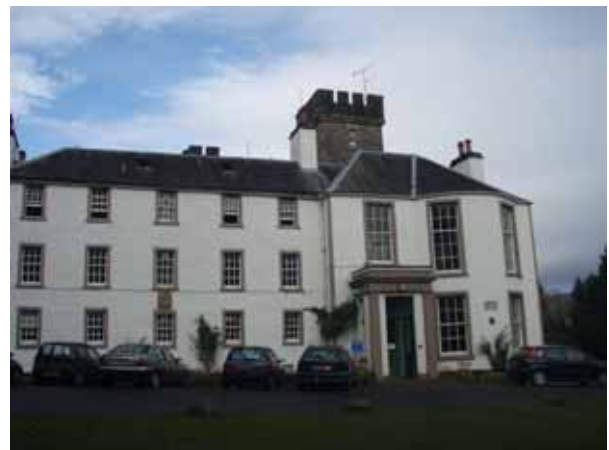
Dalguise House - my home for the six weeks I was in Scotland

I had my boats back eventually. Both my Jackson Rocker and All Star had made it up to Dalguise, PGL's only Scottish centre, the day before I arrived on site so I was looking forward to getting back out in a kayak again for a proper paddle; none of this sit-on-top malarkey. For the first week or so I think I may have moaned that it wasn't France, but eventually I settled in.