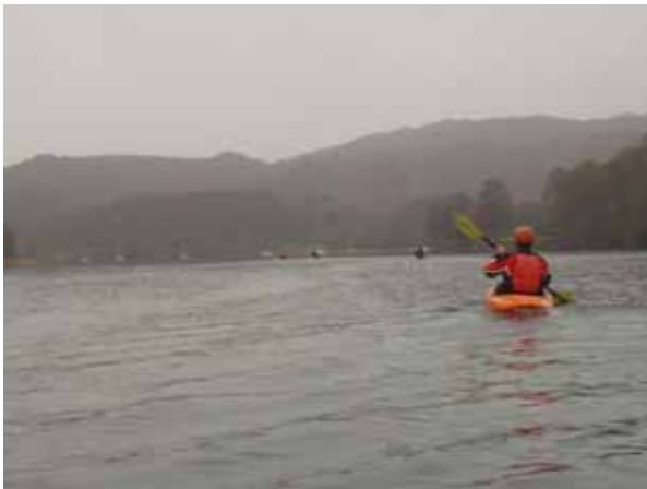
Paddling across Lake Coniston to the mouth of the Crake

On Monday I went paddling again for the third time in three days. Some of the canoe club were up in Coniston at a camping barn to see the New Year in so we chanced a trip up there in the hope of making a descent of the Crake, which flows out of the lake, with a few of the paddlers staying up there for the festivities. We had a brief chat in the camping barn over a cup of coffee before kitting up and setting off down to where we would put on the lake.