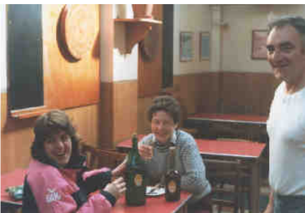
The Slalom Organiser and Timing & Control organiser, at the end of a gruelling day, being waited on by the Catering Organiser in Luneside Engineering Canteen. They were more effective in these roles than Eskimo rolls as can be seen from the following picture.

The hard work and commitment were accompanied by a great sense of pride in what was achieved and it was also an enjoyable social event, which forged bonds of friendship between paddlers from different clubs as well as between Ribble members.