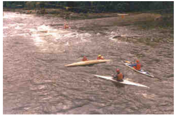
The organisers at one of the Halton Slaloms testing the cleanliness of the water and the effectiveness of the safety team.

This was the start of several slaloms run by Ribble Canoe Club at Halton. This was followed in 1985 with a Div 2 in March and a 4 & Novice in June. This trend continued until June 1989.