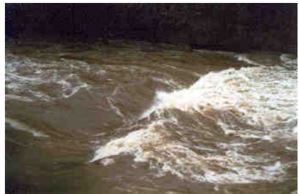
The same area during winter flood conditions

Despite the fact that I have paddled at Halton on many occasions over about 25 years I never tire of the place. In fact someone remarked the other day that he really enjoyed Halton because the river is different every time he paddles. This is of course because the water level is constantly changing and provides a changing paddling experience.