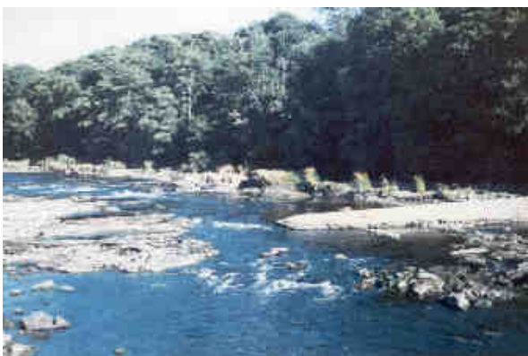
The river in summer drought conditions

However despite the favourable weather conditions, I have been quite surprised to find that there seems to be less people turning up to paddle than in the past, an average attendance seems to be about 10 to 15