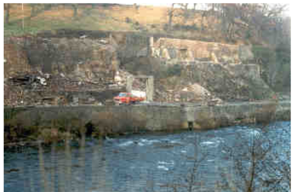
The old mill and office building during demolition. The Concrete archway behind the red truck is the entrance to the mill used by the club for changing during the winter. At the right hand side of this was a small office used for viewing and as a competition control office during slaloms.

The owners of Luneside Engineering decided to sell the fishing rights in February 1990 and from this date paddlers have not been allowed to park cars and access the river from the Luneside Bank. Parking is now at the car park adjacent to the University Boat House. At around the same time the derelict buildings were demolished.