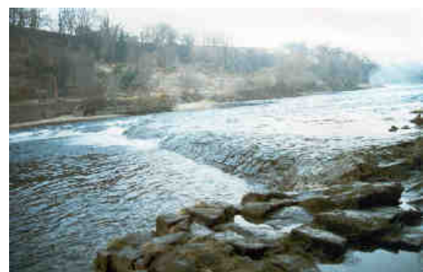
An average winter level of the same area (taken from River Left)